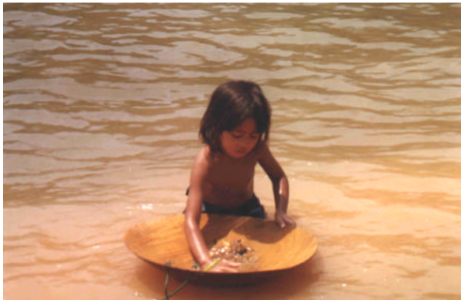
Figure 1: Young girl engaged in mining in Lao PDR

this is powered mostly by women at the far end of the raft. North of Hatkhe in Nam Ou, female workers predominate in gold mining and more than 80 percent of the workforce (approximately 100 people) consist of girls aged between five and 12, working under extremely harsh conditions, typically under adult supervision (Figure 1).