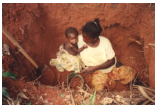
Figure 5: A miner and her child in Ghana

Children are typically the responsibility of their mothers. At many mine sites, women work with young babies tied to their backs and toddlers at their side (Figure 5). In cases where alternative childcare or schooling is unavailable or additional supplementation of income is needed, older children accompany women in artisanal mining activities, and often participate. In accordance with this, the health and safety risks faced by children depend on the type of mineral exploited, the techniques employed, and whether these activities take place in the home (e.g. in the kitchen) or at a mine site.