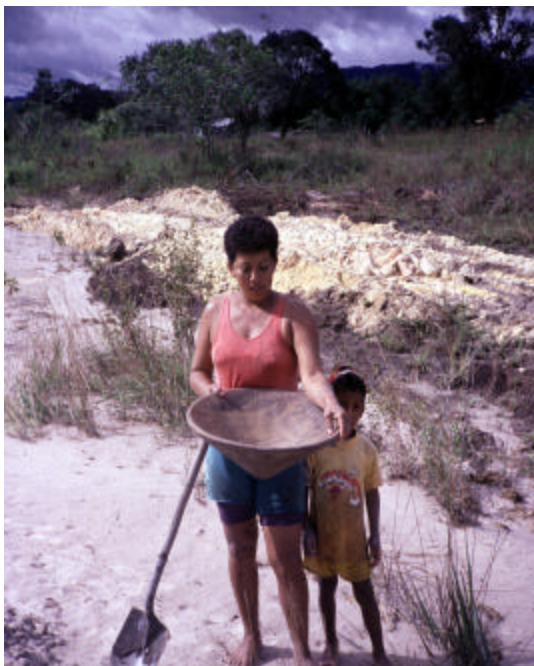
Figure 7: Venezuelan Women and a Wooden "Batea"

In cases where processing activities take place closer to home, the construction of on-site mills could markedly reduce time and effort dedicated to carrying ore. A modification such as this, however, may be less attractive to women simultaneously conducting child care or when security issues are of greater concern. The state of existing machinery may also influence women's burden of work. In the Makate district of Tanzania, improved functioning of grinding mills considerably benefited women by reducing the tonne/km load by more than 90 per cent (Everts, 1998). Although the mill was applied in an agricultural context, this lesson is readily transferable to artisanal mining.