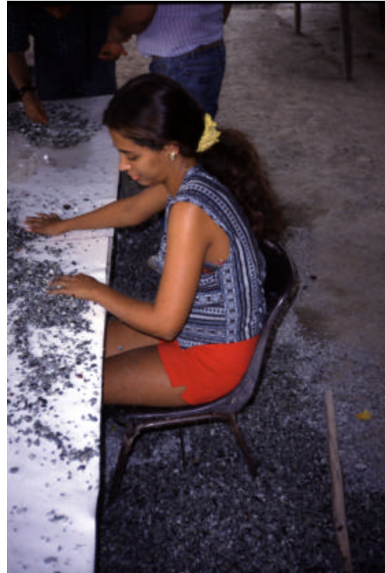
Figure 2: Women handpicking emeralds in Campos Verdes, Brazil

becomes head of the household due to death or abandonment of a spouse, men typically maintain control of finances in family mining operations.