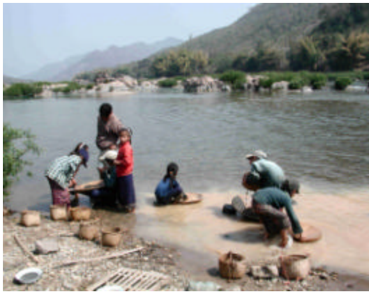
Figure 4: Children Engaged in Panning in Laos

2000), an overwhelming difference from the national average of 63 years (World Bank, 2002). In Lusaka, Zambia, women are illegally involved in the manual crushing of marble, and face a high potential for developing pneumoconiosis (Dreschler, 2001). Crushing and grinding can be accomplished using a number of mechanical means (e.g. hammer mills) or manual techniques, such as a mortar and pestle. When the degree of mechanization is low, women are more likely to predominantly be engaged in this activity.