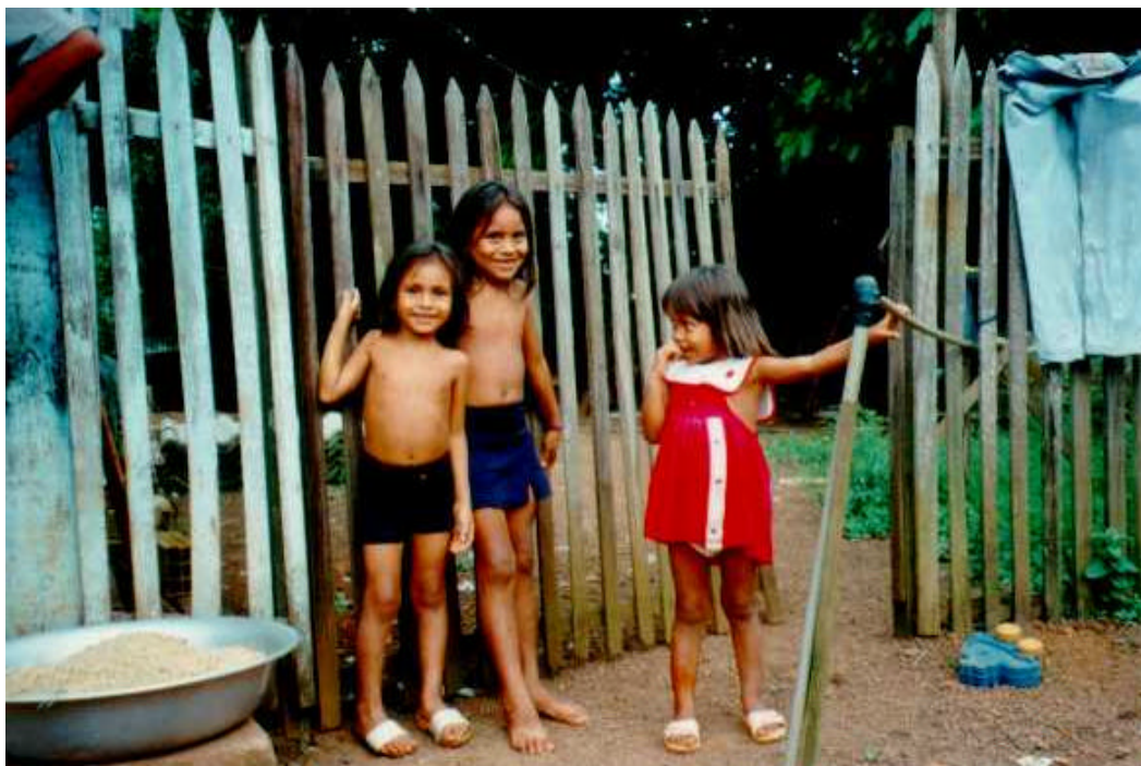
Figure 3: Girls in an established Brazilian mining community – high hopes but limited opportunities

for injury or illness; thus, the cycle of ill health and poverty is perpetuated.