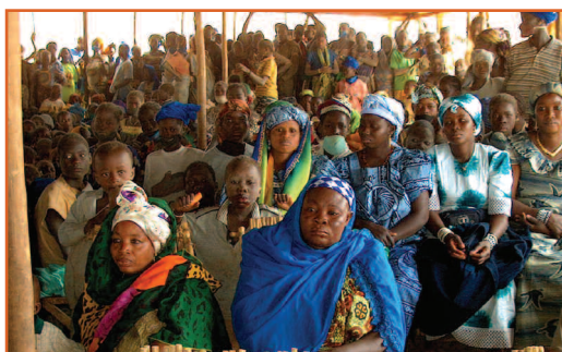
Community consultation in Burkina Faso

Inclusion of women in these consultations is essential to obtaining a valid social license to operate, and to ensuring that use of mining revenue reflects the views and priorities of all community groups and not just the community leadership, who are typically men. Unless the views of all groups are obtained, priorities may not meet the needs of the