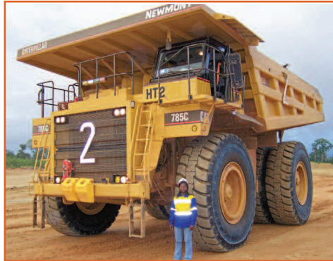
Female employee of Newmont Mining Corporation

For many countries, extractive industries (EI) are a major economic driver: creating jobs, revenue, and opportunities for growth and development. There are also risks associated with EI, in terms of social and economic upheaval and environmental harm. The impacts of these benefits and risks are often considered only at the community level, without exploring how they are allocated within the community. World Bank consultations with different