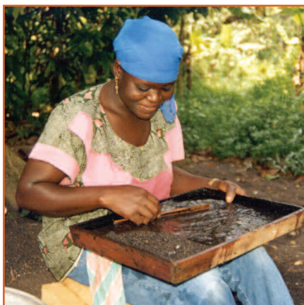
Diamond sorting in Ghana

In what ways do men and women experience extractive industries differently – positively and negatively – and what are the impacts of these differences on the men and women involved, on families and communities, and on EI operations? This section focuses primarily on larger scale commercial operations but with the final sub-section addressing the specific issues of ASM.