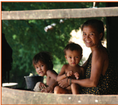
Woman with children

Why is it important to understand the ways in which men and women are differently impacted by the extractive industries, and what is the value-added of ensuring that women have equal access to the benefits of EI?