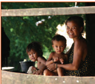
Woman with children

Why is it important to understand the ways in which men and women are differently impacted by the extractive industries, and what is the value-added of ensuring that women have equal access to the benefits of EI?