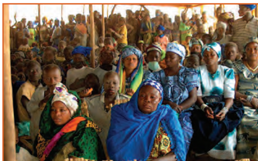
Community consultation in Burkina Faso

Inclusion of women in these consultations is essential to obtaining a valid social license to operate, and to ensuring that use of mining revenue reflects the views and priorities of all community groups and not just the community leadership, who are typically men. Unless the views of all groups are obtained, priorities may not meet the needs of the