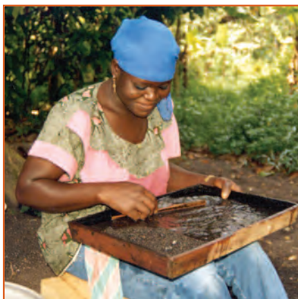
Diamond sorting in Ghana

In what ways do men and women experience extractive industries differently – positively and negatively – and what are the impacts of these differences on the men and women involved, on families and communities, and on EI operations? This section focuses primarily on larger scale commercial operations but with the final sub-section addressing the specific issues of ASM.