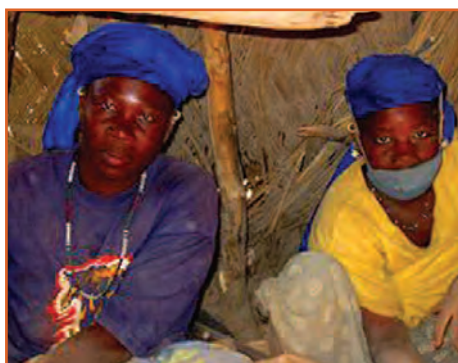
Artisanal miners in Burkina Faso

Small-scale miners are typically paid based on delivery of product, so women may work all day, but earn little cash income, and still be responsible for additional work and responsibilities at home. 56 Working in communities where there are often few, if any other cash generating alternatives, women may work extreme hours, including at night, and even while heavily pregnant, but with no benefits or security. 57 Furthermore, even in artisanal mines, women may have little control over resources. 58 Evidence indicates that women often work longer hours than men, but