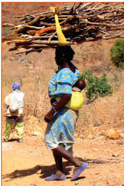
Women gathering firewood

EI often means the conversion of land to new uses – either for extraction itself, or for support infrastructure (roads, ports, housing, clinics, and offices). This can mean the loss of subsistence agriculture and farmlands and cutting off access to resources like water and food. In many countries, men are typically land titleholders, so men are more likely to be the ones compensated for loss of land, even if it is women who work the land and are equally – if not more so – impacted by the loss, in terms of access to fresh water, vegetable gardens, gathering firewood, accessing food, and ceremonial uses. Women may not see much or any of the compensatory money, reducing their resiliency from these changes and their ability to provide for dependent family members.