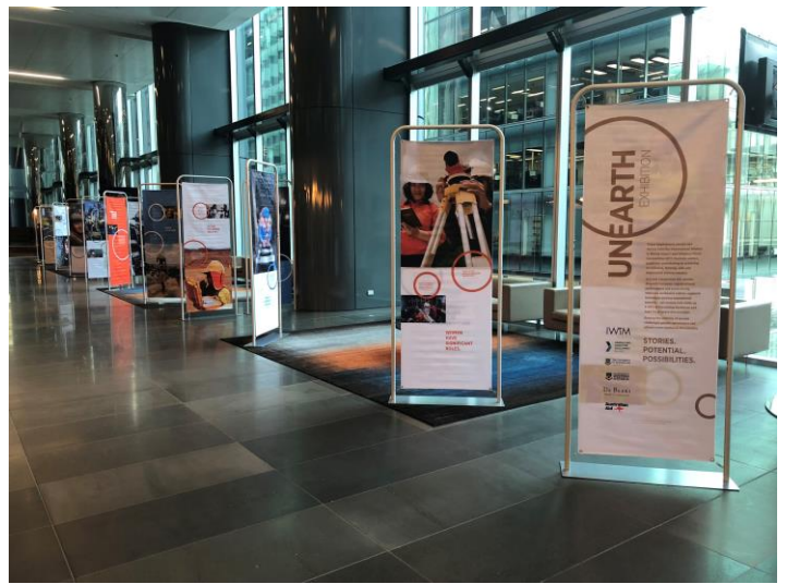
BHP, Perth, Australia